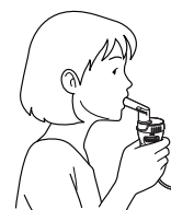
Using the Mouthpiece