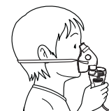
Using the Child Mask