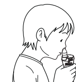
Using the Nosepiece (Option)